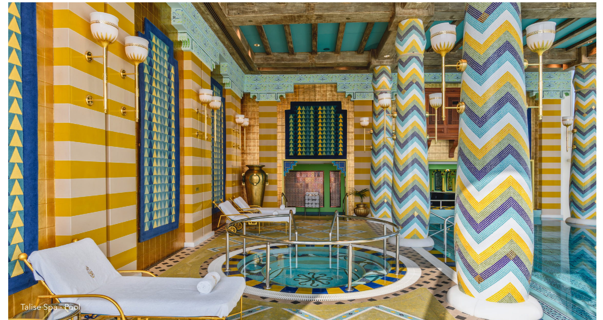
Talise Spa - Pool