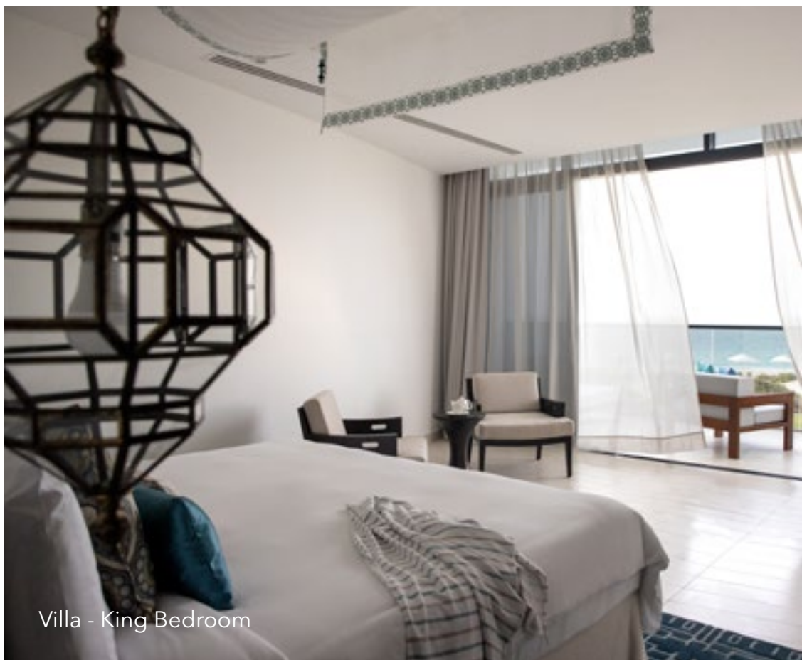
Villa - King Bedroom