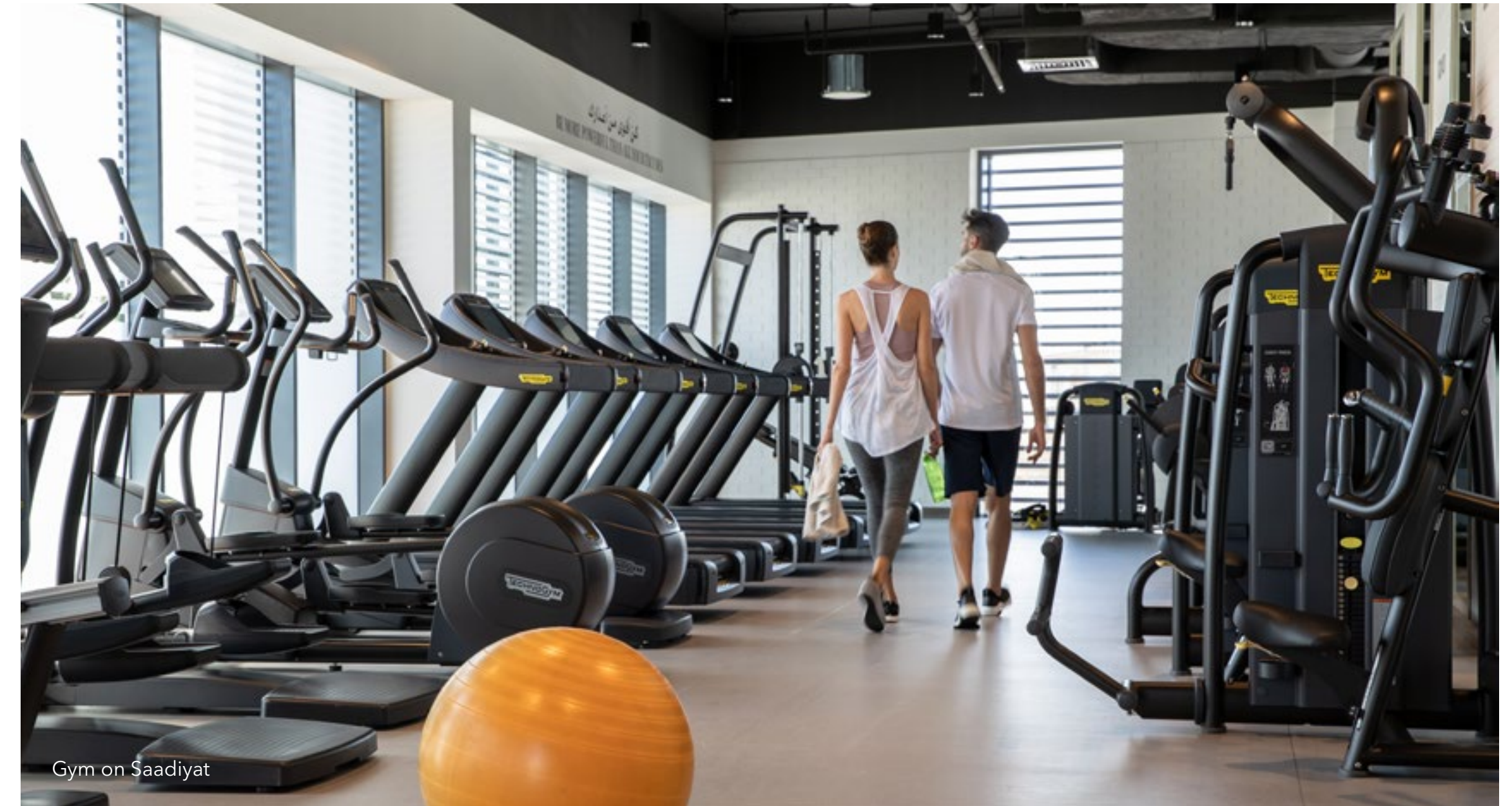
Gym on Saadiyat