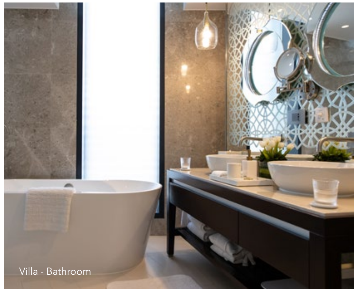
Villa - Bathroom