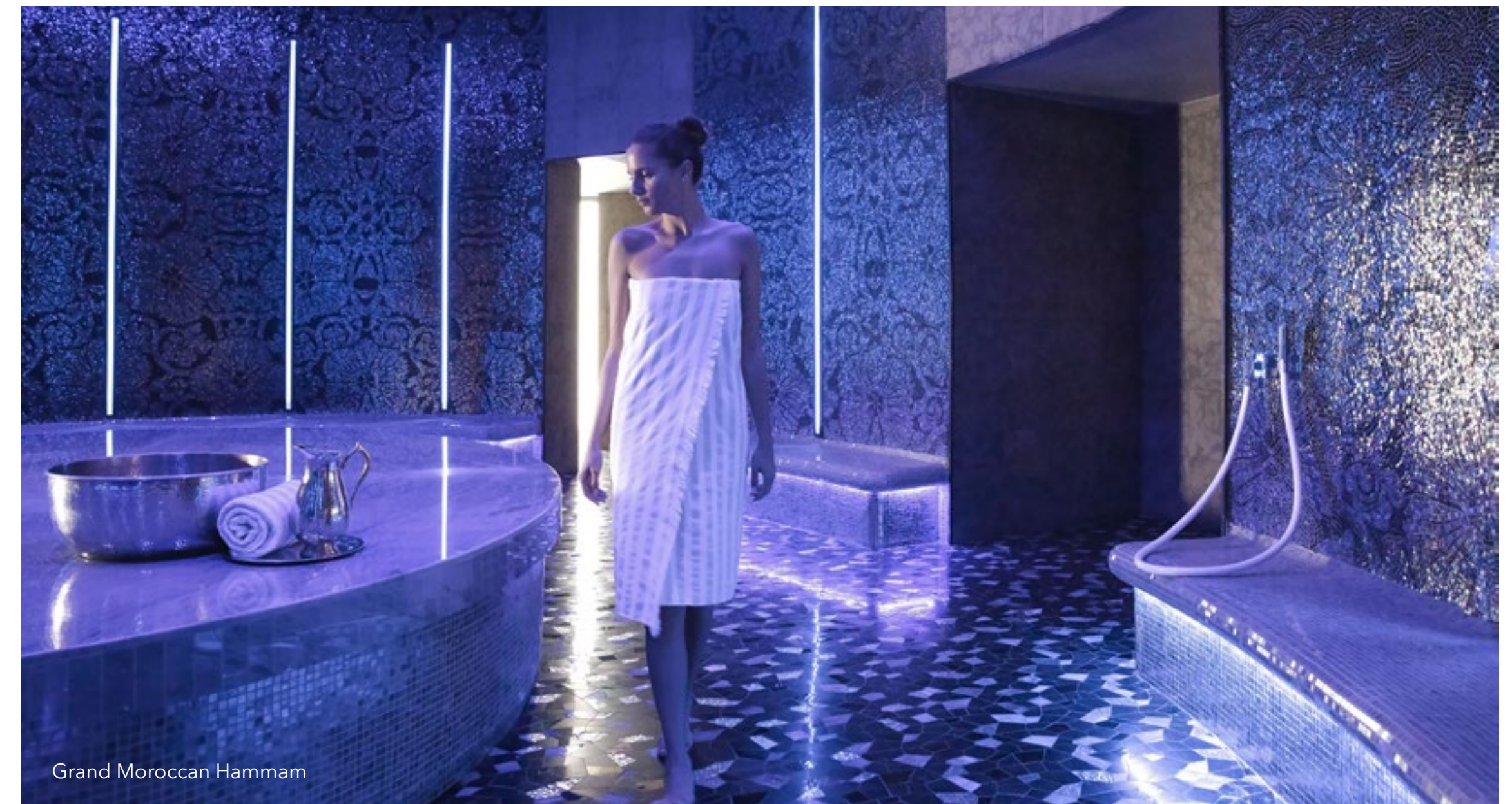
Grand Moroccan Hammam