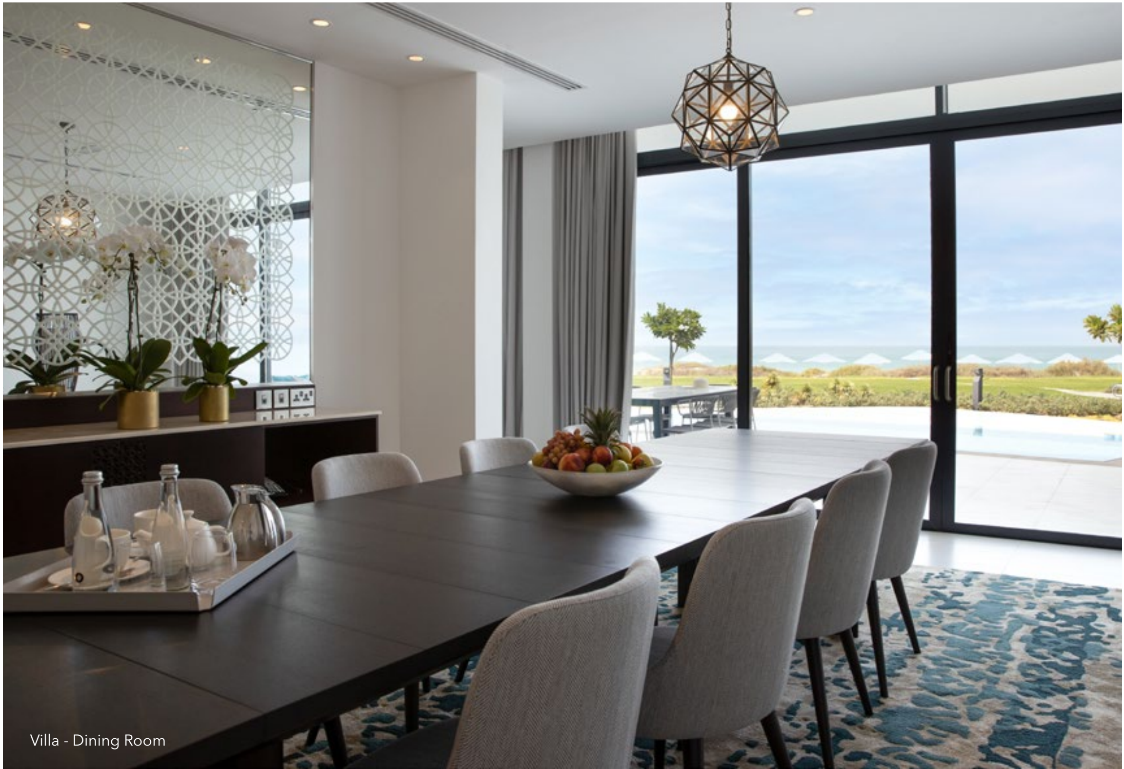
Villa - Dining Room