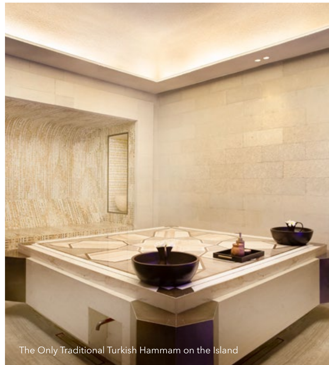
The Only Traditional Turkish Hammam on the Island

Jumeirah Bali is committed to sustainable practices, featuring the most advanced desalination system in the world. The resort also supports the local community through the Jumeirah Uluwatu Foundation, dedicated to the wellbeing of the Balinese people.