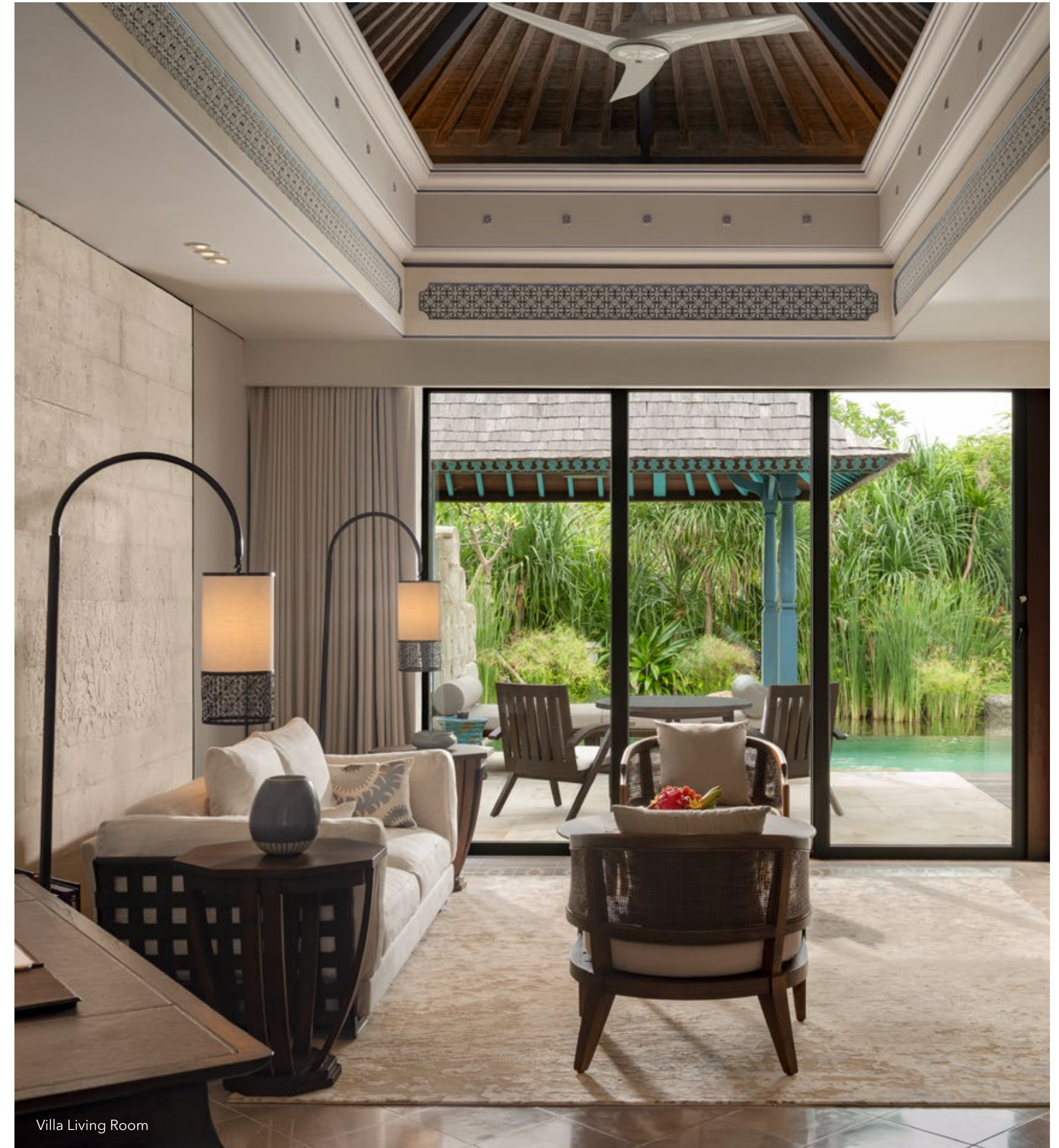
Villa Living Room

Blending indigenous building materials with contemporary and luxurious comfort to provide a sense of timeless elegance, the resort features dark stone structures, traditional carvings and statues, pools and fountains with floating plants and colourful fish. Combined with impeccably kept gardens and lush surroundings, guests are transported to an authentic Balinese haven of understated elegance with an opulent touch.