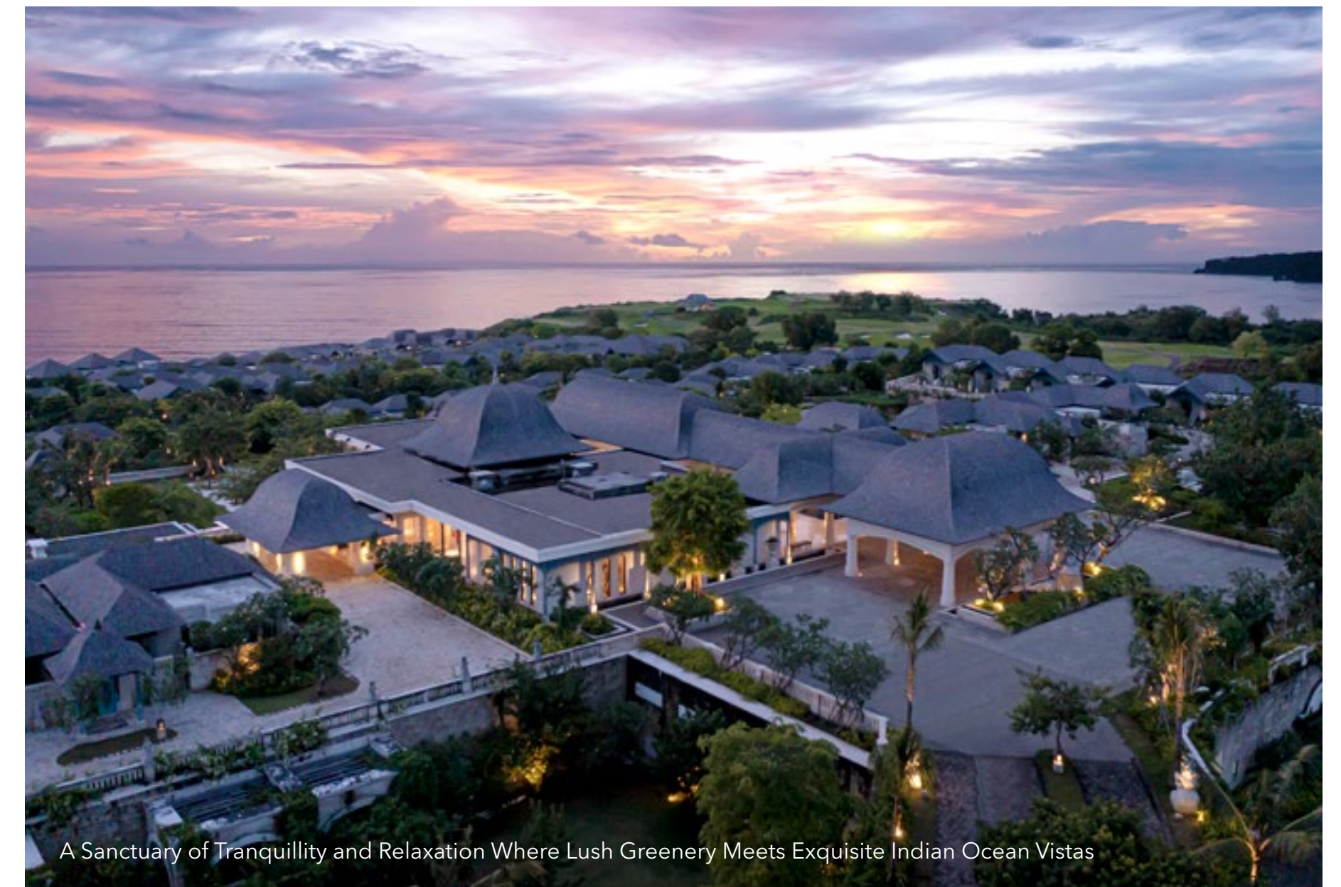
A Sanctuary of Tranquility and Relaxation Where Lush Greenery Meets Exquisite Indian Ocean Vistas