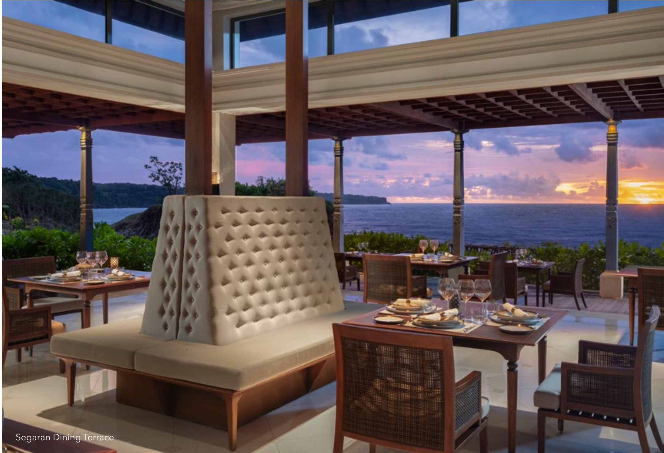
Segaran Dining Terrace

Jumeirah Bali guests are guaranteed exceptional dining experiences at its three signature restaurants and bars overseen by Master Chef Vincent Leroux, each offering awe-inspiring views across the island's crystal blue waters and stunning sunset panoramas.