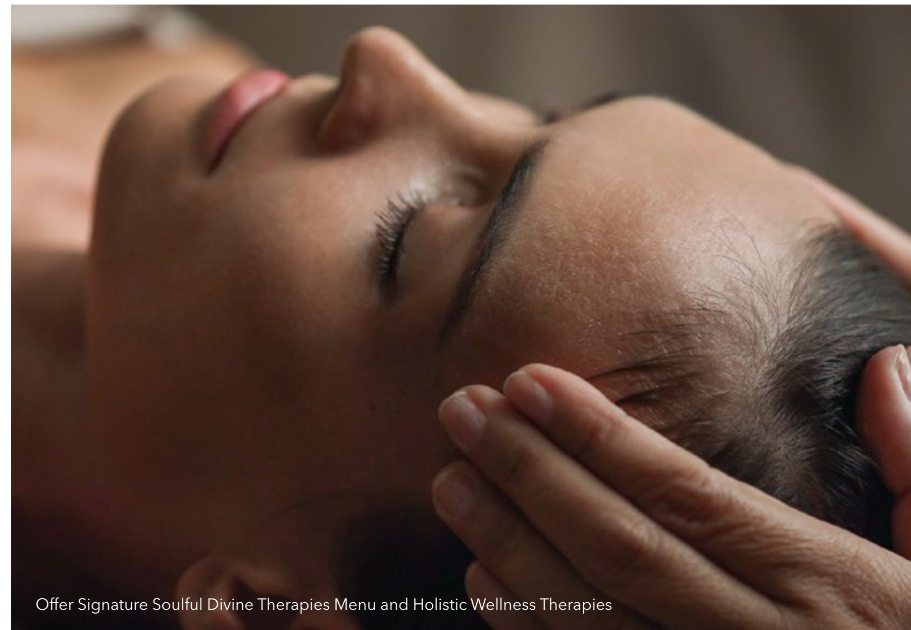
Offer Signature Soulful Divine Therapies Menu and Holistic Wellness Therapies