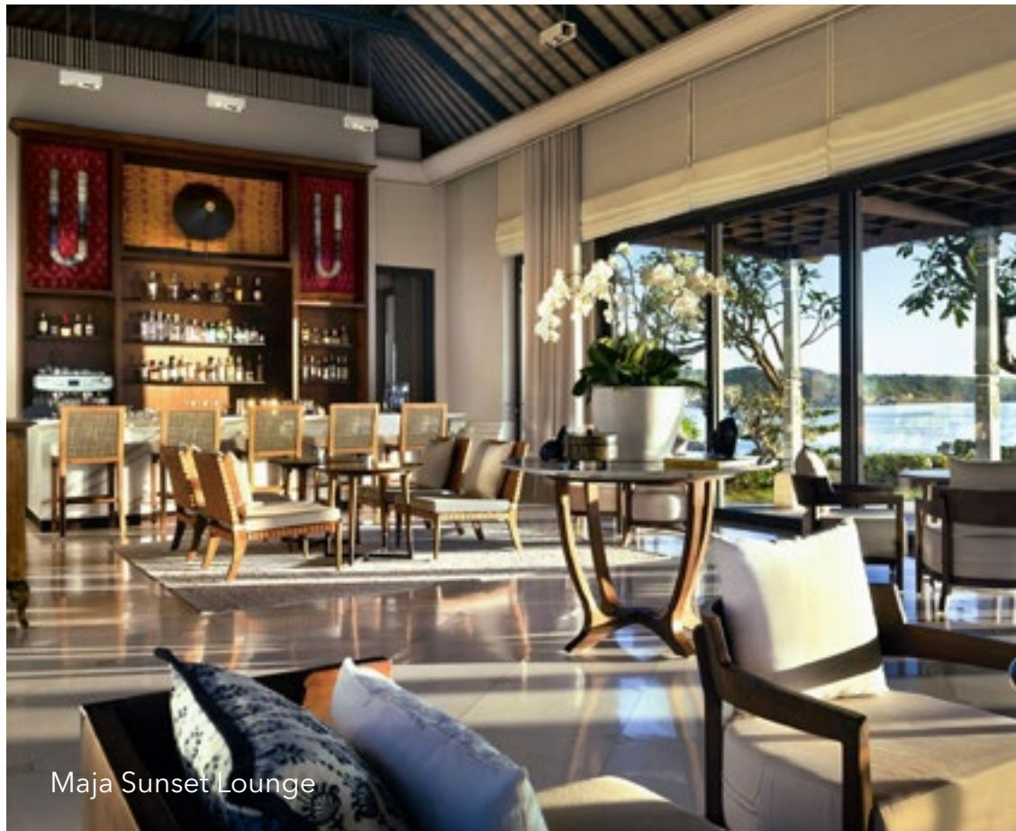
Maja Sunset Lounge

Located on the ocean front, Segaran offers exquisite Balinese and Southeast Asian cuisine, focused on exceptional ingredients with a 'farm to table' philosophy.