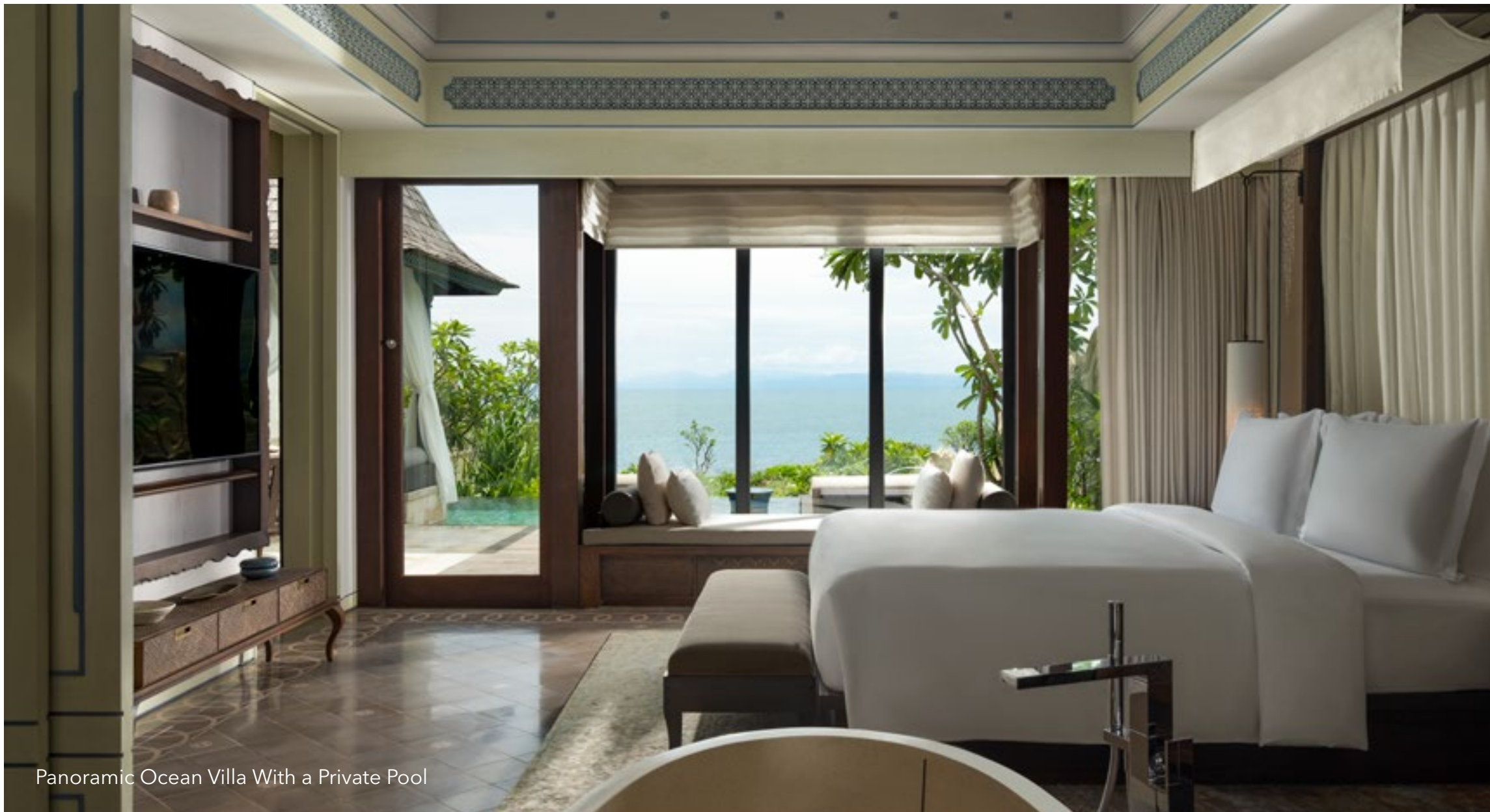
Panoramic Ocean Villa With a Private Pool